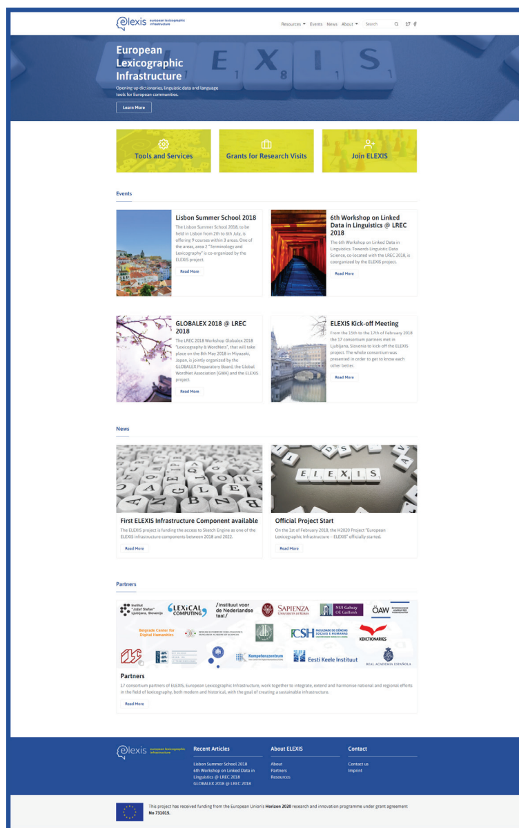
Figure 2: ELEXIS Website